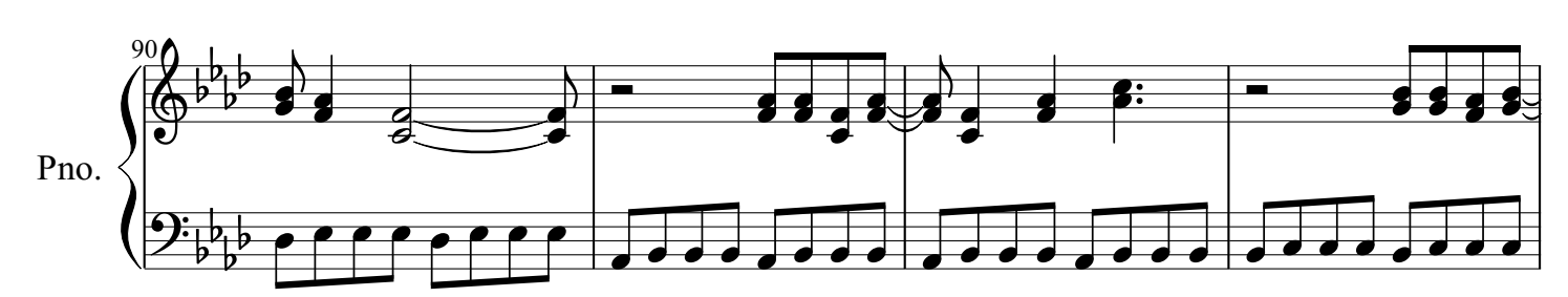
*1 The lower note is the melody. Make it speak more than the top note. This section doesn't sound right to me no matter how it's written, so feel free to play it differently- leave out the top note, add in lower notes, whatever.